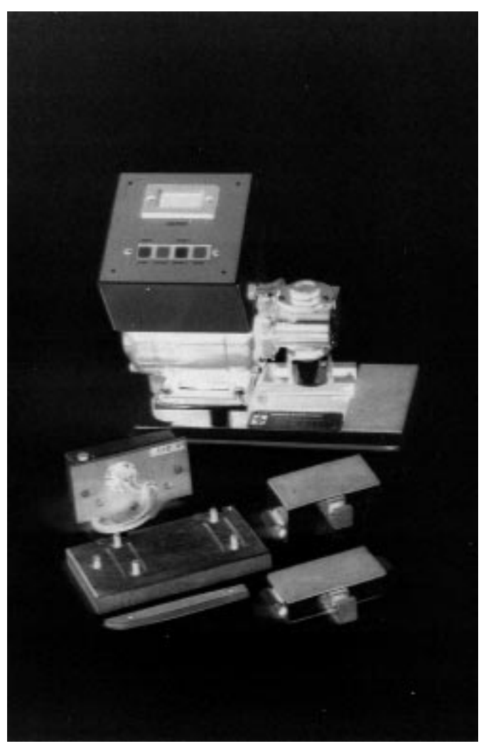
FIG. 1 Sutherland Rub Tester and Attachments

7.1.3 Pressure-sensitive tape or any tape suitable for holding the sample without interfering with the operation of the tester.