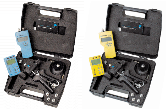
For full details please refer to the PV 411A datasheet.