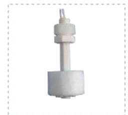
LS03 M8 x L:53