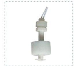
LS02 M8 x L:42.5