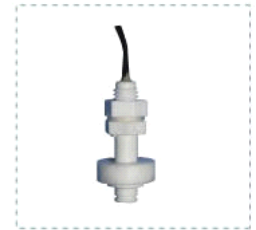
LS01 M8 x L:37