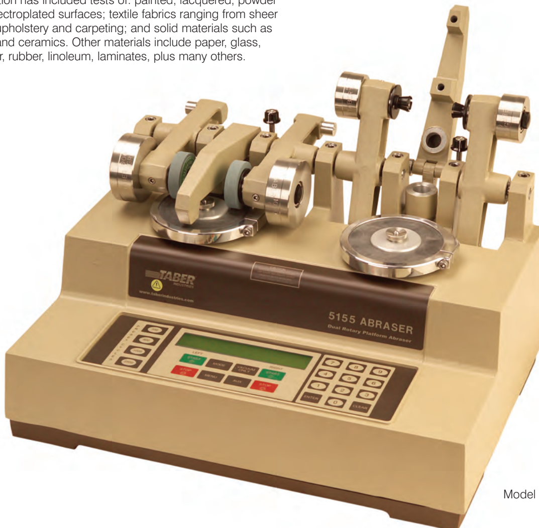
Model 5155 Shown