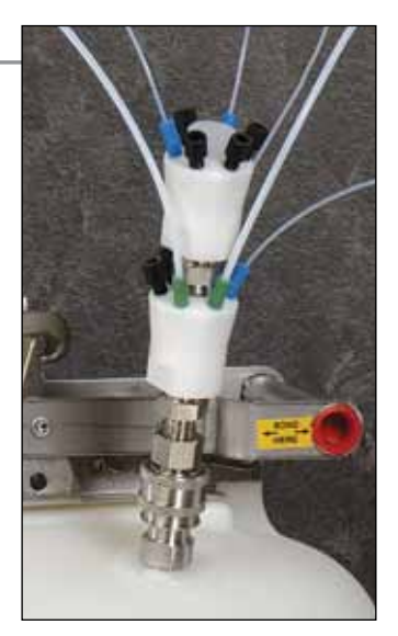
Manifold 86394-27 attached to 86394-31 "stacker"