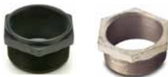
Polypropylene Galvanized Steel

Keeps pump snug in container bung and limits the escape of fumes.