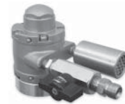
M57 Air Motor