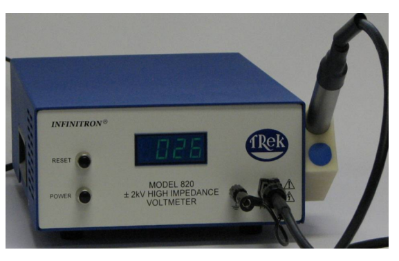
Figure 5: Probe holder shown at right

Another way to remove any extraneous charge from the voltmeter input capacitance is to touch the probe tip to the blue circle area (zero pad) on the holding fixture which is referenced to the voltmeter's ground. This will remove the extraneous charge without utilizing the RESET function. Touching the zero pad with the point of the probe should be performed between each succeeding measurement.