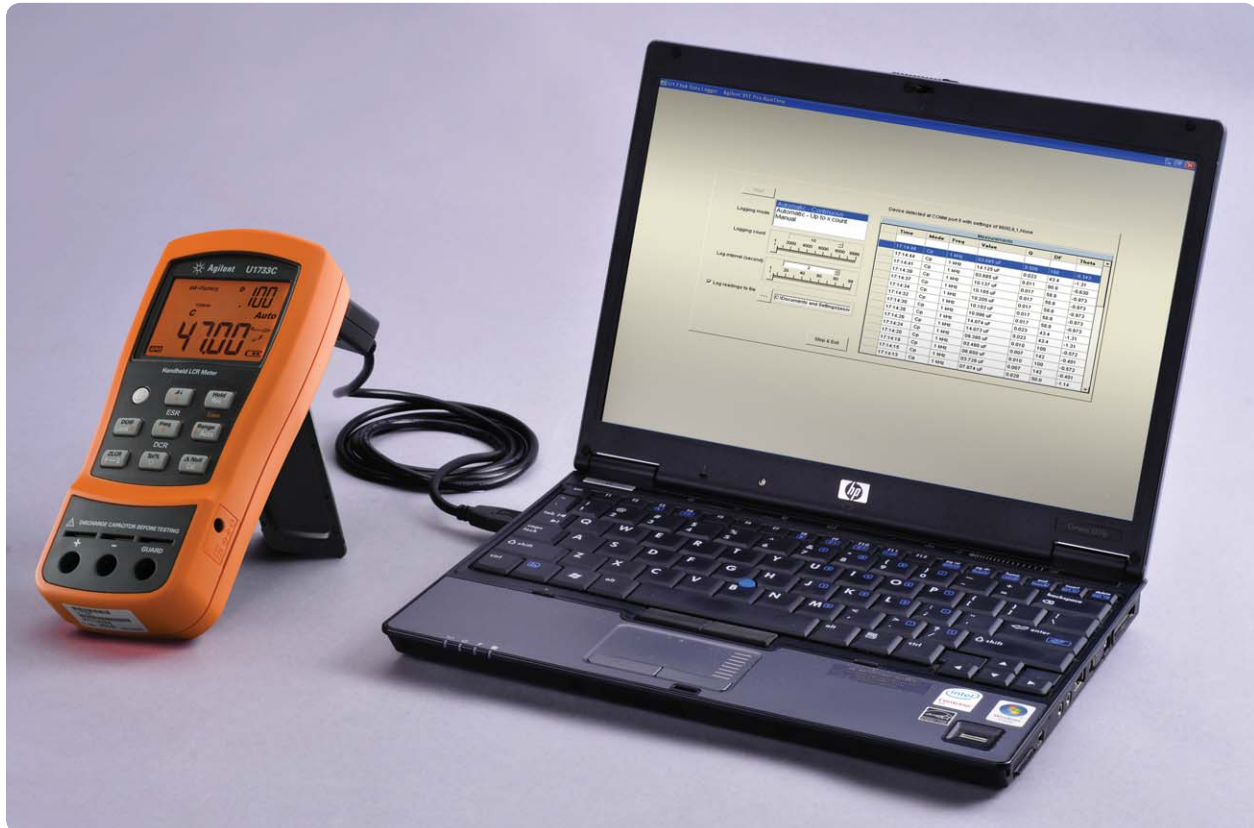
Figure 1. Automate the recording of continuous readings when you hook the U1731C/U1732C/U1733C to a PC

The handheld LCR meters allows you to test various component types, including secondary components of Dissipation Factor (D), Quality Factor (Q), and Angle Indication of Impedance ( \theta ). This new handheld series also includes other functions that result in a more detailed component analysis. For example, the built-in Equivalent Series Resistance (ESR) function helps you better understand the inherent resistance behavior typically found in capacitors across selected frequencies. DCR is a built-in DC resistance measurement that eliminates the use of a separate digital multimeter (DMM) for component test.