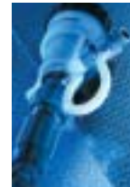
The «External Injection» option allows to inject specific corrosive concentrates.

These options allow adapting your Dosatron to your needs. Contact our technical service to help determine what option you may need.