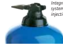
Integrated by-pass : system of turning concentrate injection on and off.

These options allow adapting your Dosatron to your needs. Contact our technical service to help determine what option you may need.