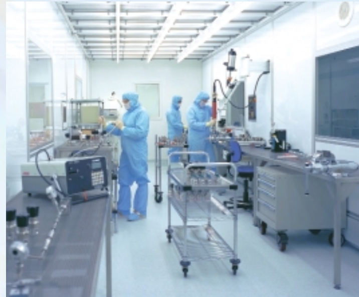
Assembly & test are performed in a class 10 Cleanroom

We can satisfy your most demanding application.