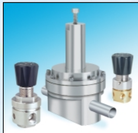
44-3200 15 Series 44-2200