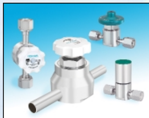
31-1 Magnum 35 Series PV72 33 Series