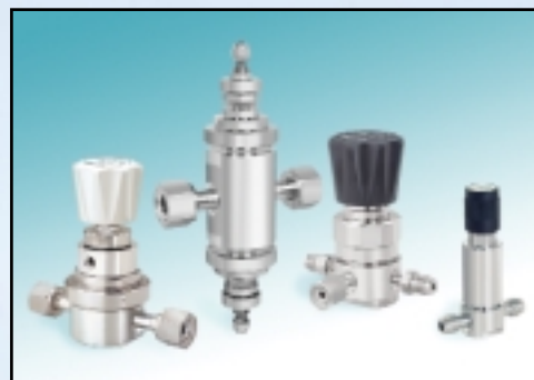
23 Series 449-260 64-2600 12 Series