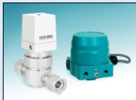
FOCUS F1 ER3000 Series