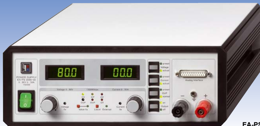
EA-PS 9080-50 T