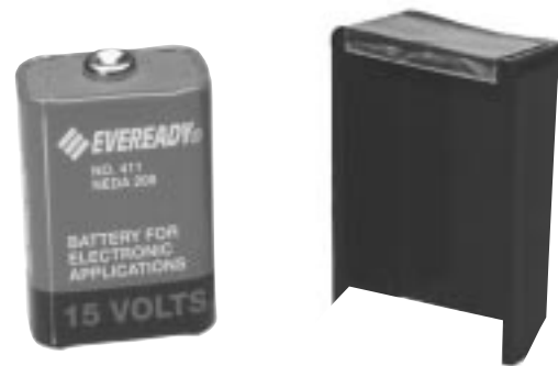
Model No. 45002