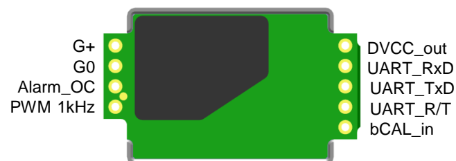
Figure 3. Pin assignment