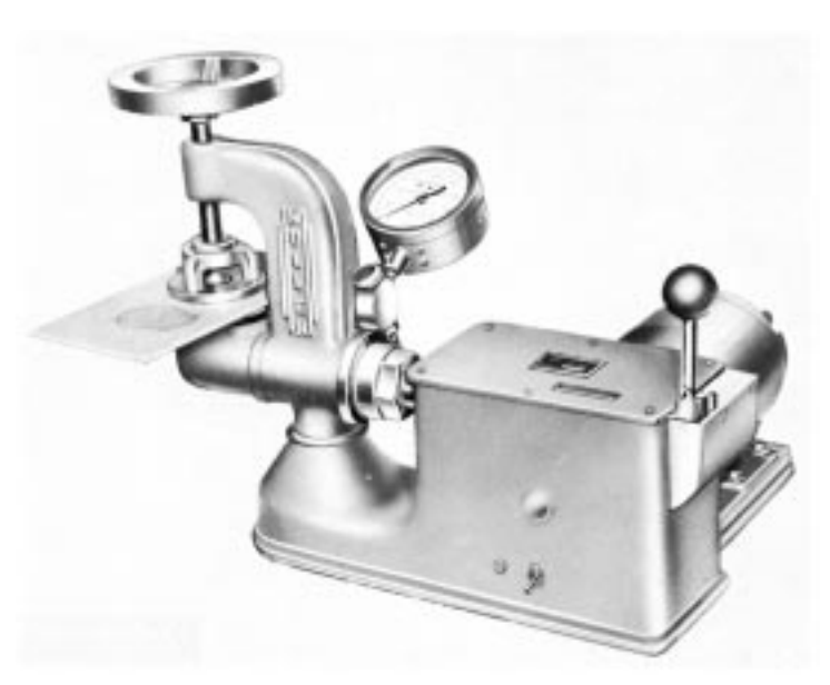
FIG. 1 Mullen Tester, Model A