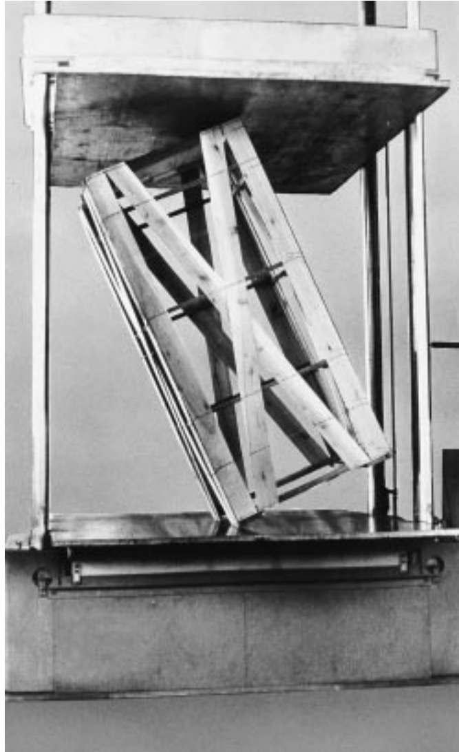
FIG. 1 Compression Applied Diagonally Opposite Edges