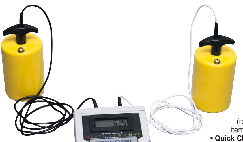
Footwear - ESD S9.1 - Footwear -Resistive Characterization