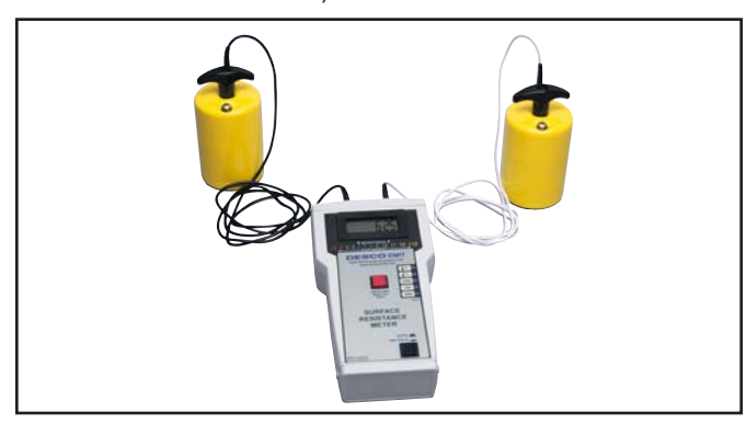
Figure 4. Setting up for RTT testing.

If measurement is outside acceptable limits, clean surface & retest to determine if cause of failure is insulative dirt layer or the ESD protective product. Note: Use an ESD cleaner containing no insulative silicone (i.e. Reztore™ Antistatic Surface and Mat Cleaner)